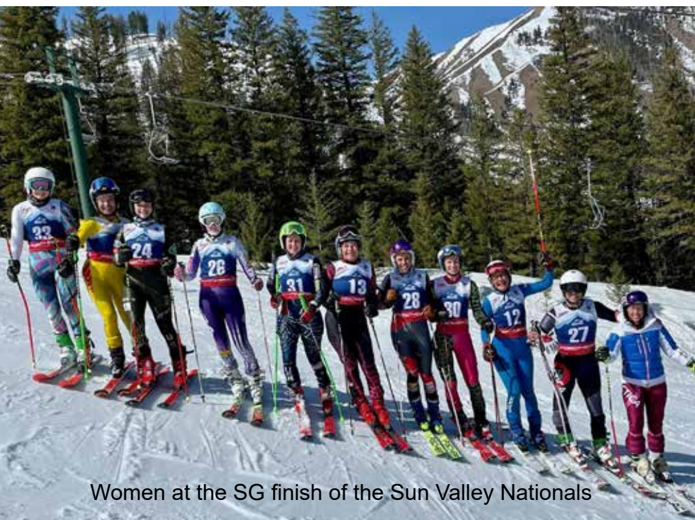
Women at the SG finish of the Sun Valley Nationals