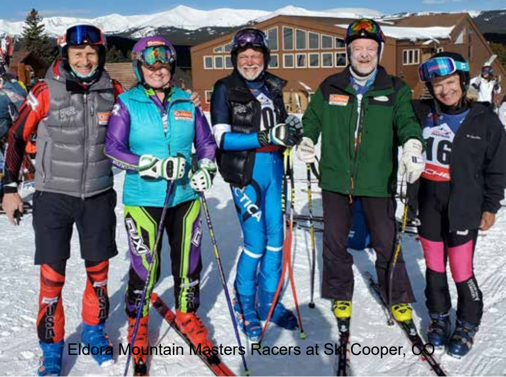
Eldora Mountain Ski Masters Racers at Ski Cooper, CO