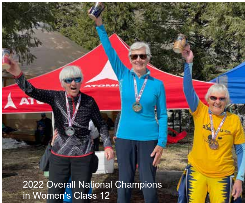
2022 Overall National Champions in Women's Class 12